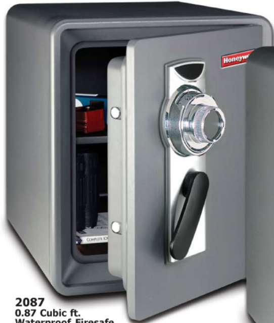
2087 0.87 Cubic ft. Waterproof Firesafe