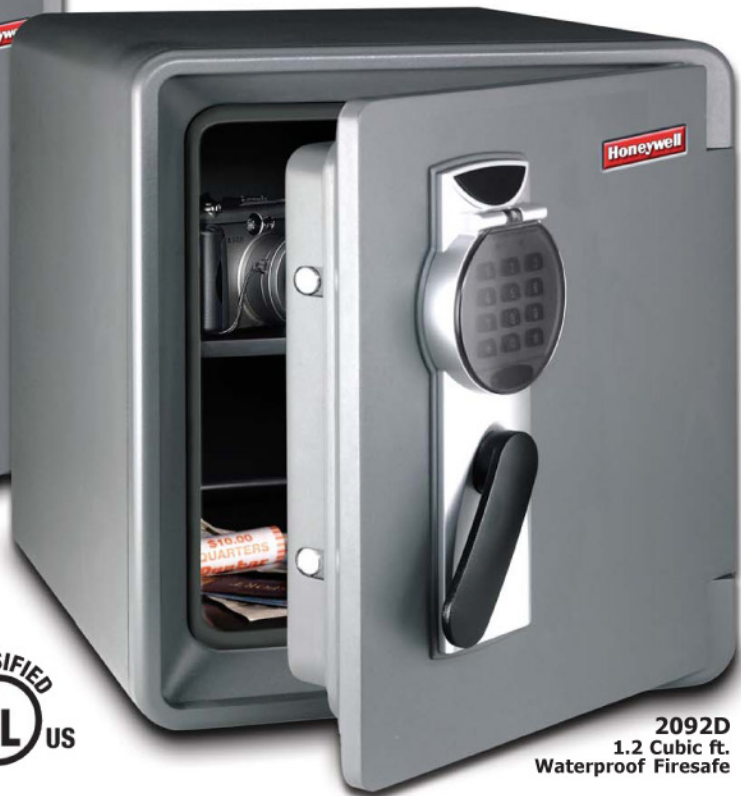
2092D 1.2 Cubic ft. Waterproof Firesafe